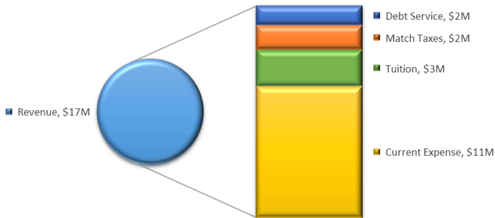
FY23 Revenue Sources