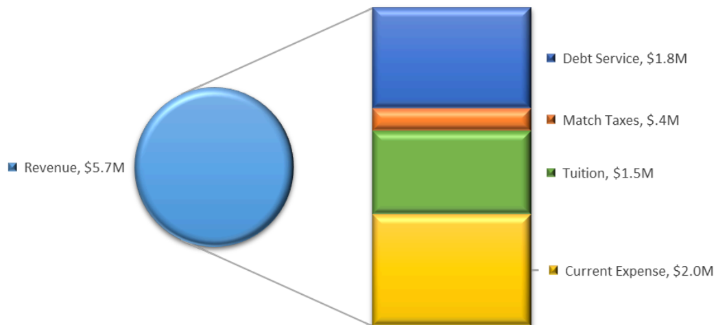
FY23 Revenue Sources