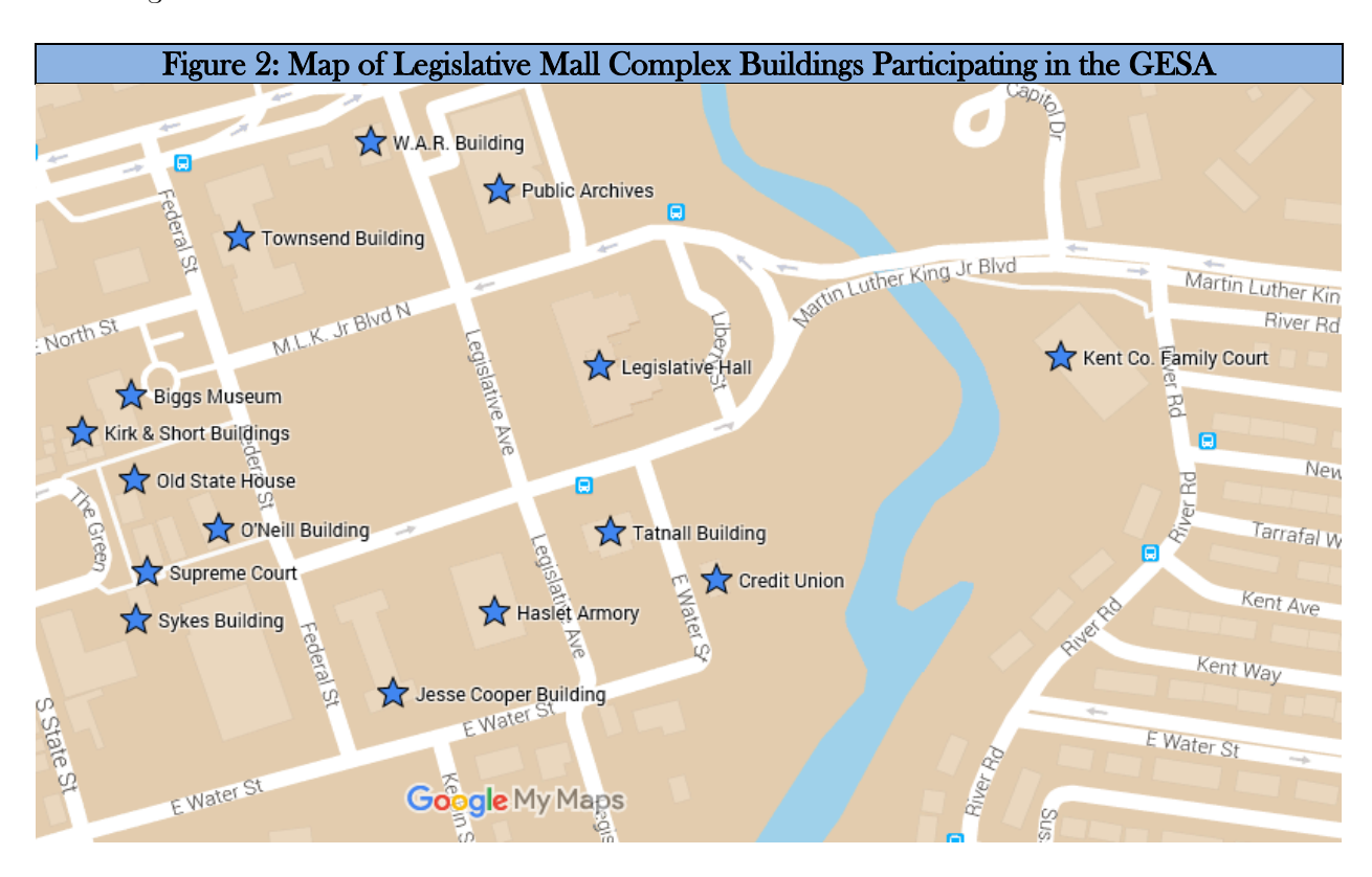
The True Cost of Legislative Mall Complex Improvements

AOA constructed the following map of the 16 buildings originally included in the Legislative Mall Complex improvements in Figure 2 below. Through our procedures, we found that the planned ECMs at Legislative Hall were removed from the scope of work and substituted with ECMs at the James Williams Service Center, Ag Lab, Ag Building, Fire Marshal's Office, Fire School, Thomas Collins Building, and William Penn Building. The documentation provided no explanation for the change.