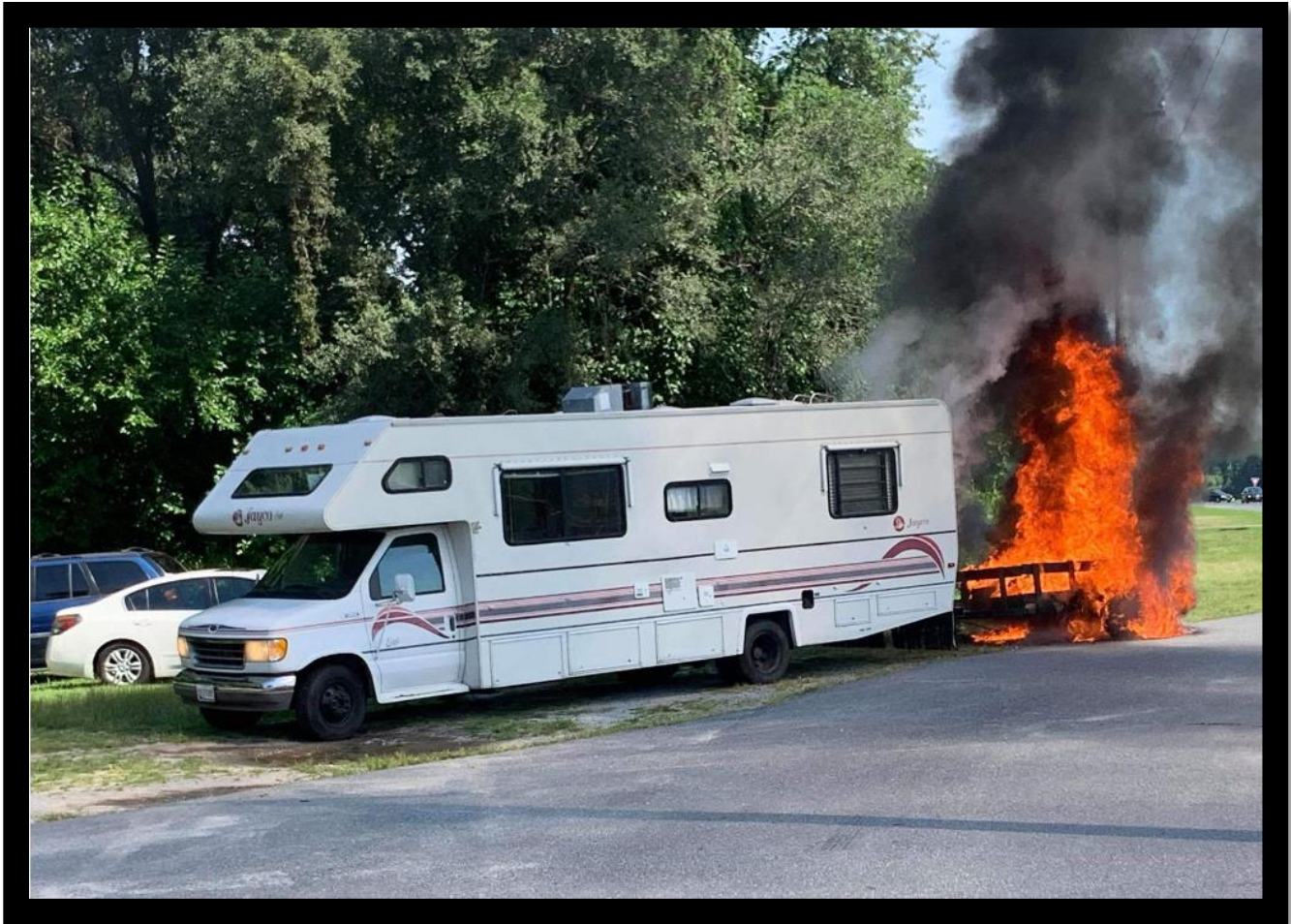
Golf Cart Fire on Trailer – July 14, 2019