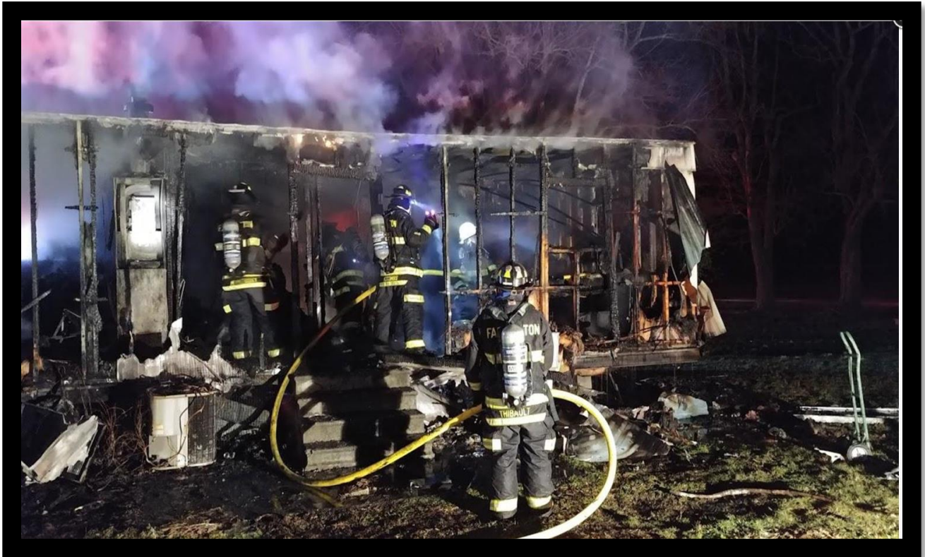
Trailer Fire – April 4, 2019