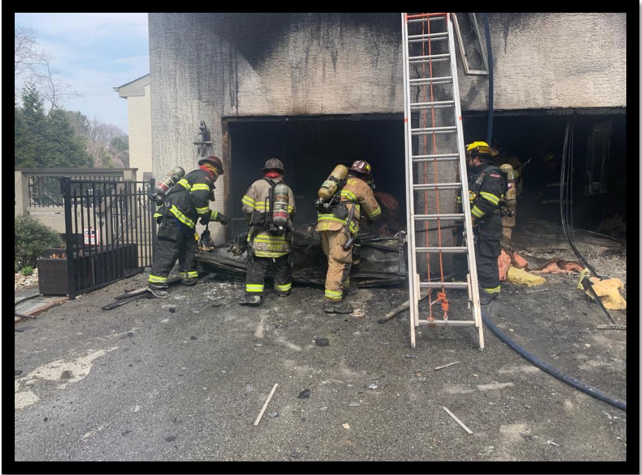
Residential Fire – April 7, 2019

Thankfully, no firefighters were lost in the line of duty through June 30, 2019. This is a direct reflection on the quality of training provided to firefighters and other fire service volunteers.