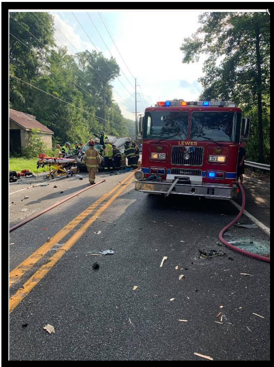
Motor Vehicle Crash – August 6, 2019