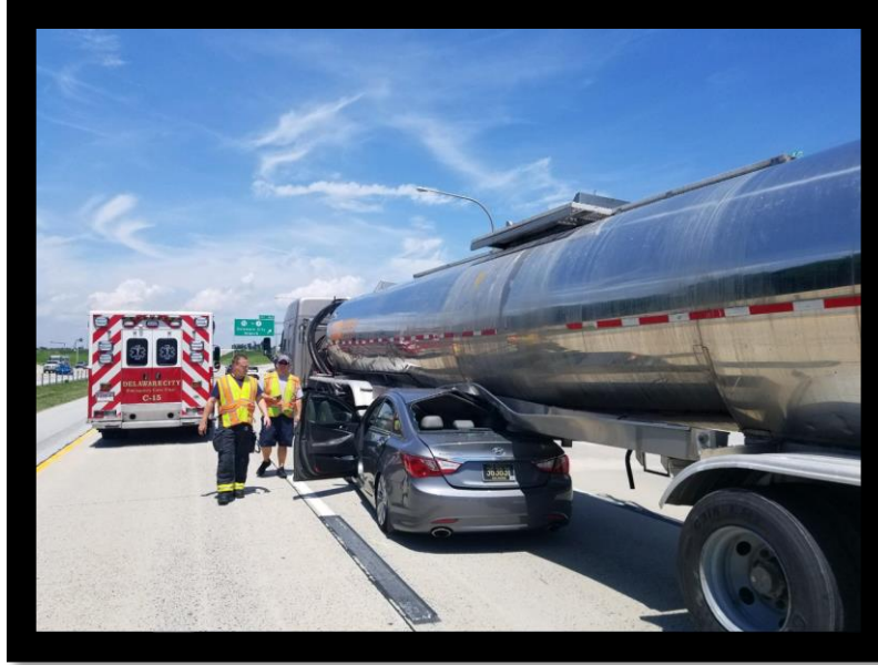
Motor Vehicle Crash – July 17, 2019