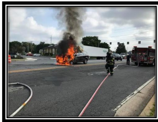
Motor Vehicle Accident – August 1, 2019