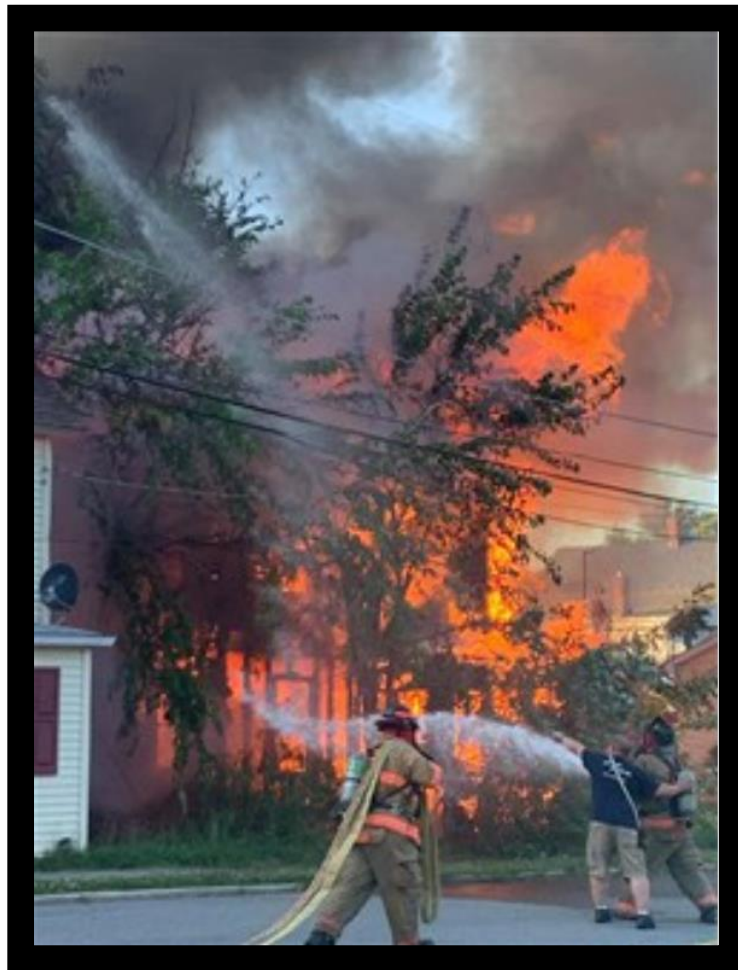
House Fire – June 25, 2019

Employee apparatus was estimated to be $21,400 per firefighter, with an estimated life expectancy of 10 years. The statewide equivalent for 1,932 firefighters is $4,134,480 annually.