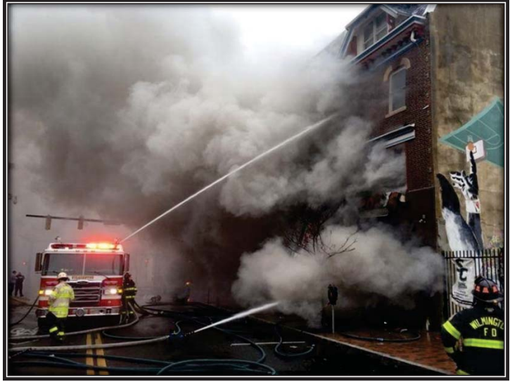
Commercial Building Fire – March 26, 2017