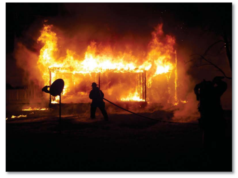
Working Trailer Fire - November 21, 2016