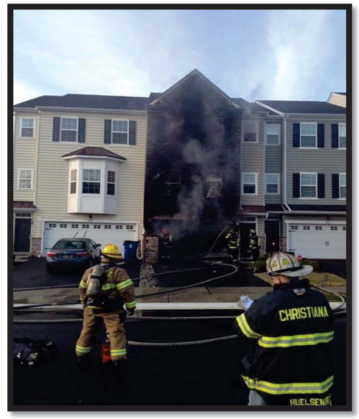
Working Townhouse Fire – February 8, 2017

Employee apparatus was estimated to be $15,725 per firefighter, with an estimated life expectancy of 10 years. The statewide equivalent for 2,100 firefighters is $3,302,250 annually.