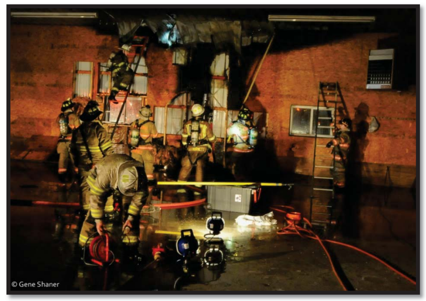
Structure Fire – May 22, 2017 Clayton and Cheswold VFD

**Aerial trucks, tankers, and pumper tankers are required by approximately half of the companies for specialized needs.