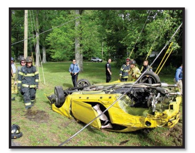
Automobile Accident – May 12, 2017